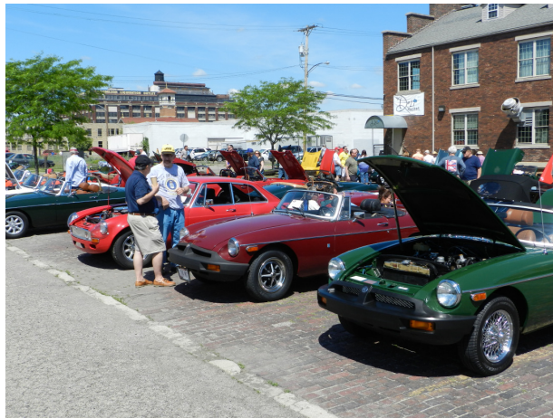
Many mighty fine MGs