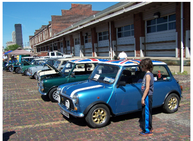
Minis and MINIs in mass in a tribute to the 55 th year since production of the Mini began.