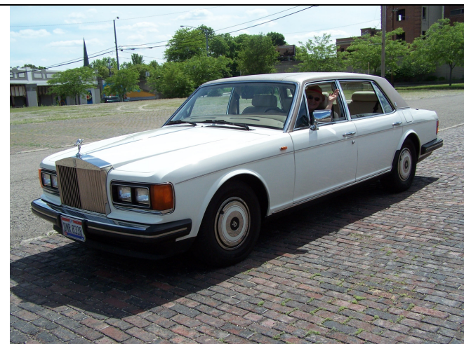
The Car Meet at the Market brought out the 1989 Rolls-Royce Silver Spur Of BTM