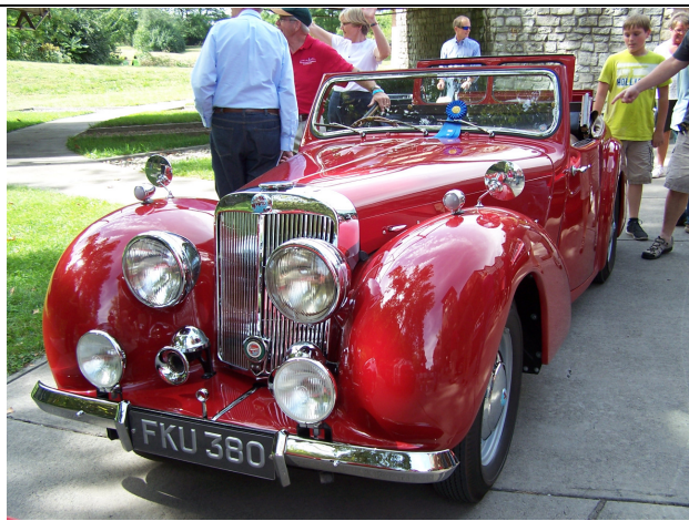
BEST OF SHOW 1948 Triumph 1800 Roadster Owner, Pete Melville of Kettering, OH