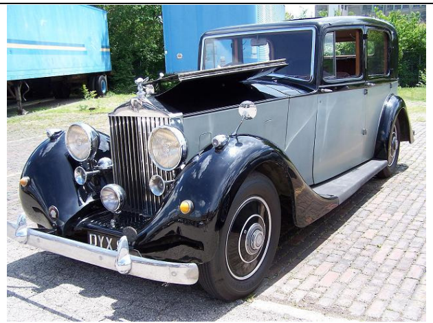
Very Nice Rolls entered