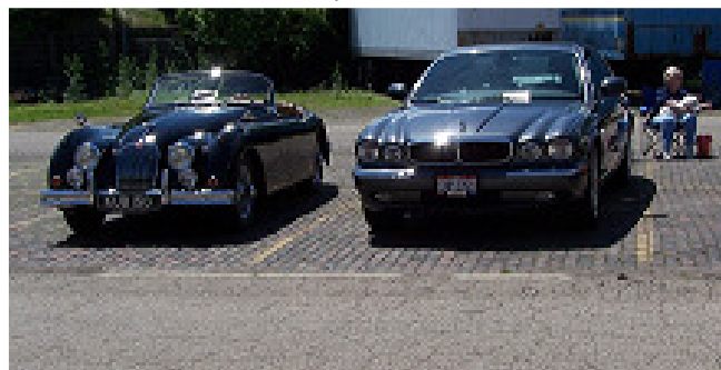
Jaguars pose for a striking picture