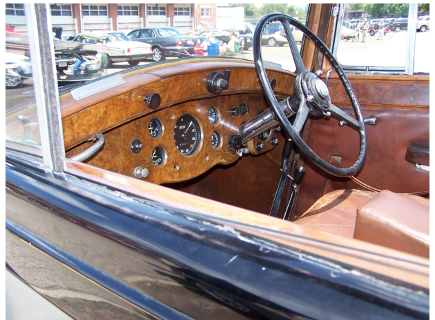
Dash & Interior of above Rolls