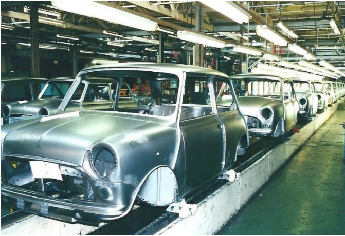
... and the main assembly line ...